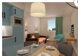
Résidence Callou New in 2025 Reopening January 2025

Ibis Vichy Hotel*** Reopening August 2024