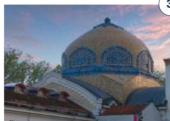
Thermes les Dômes Opening from January to March 2025