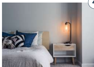
Mercure Vichy Hotel**** Reopening September 2025

Résidence les Dômes New in 2026 Reopening spring 2026